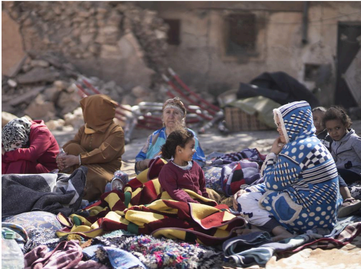
Families sit in front of their destroyed houses in Marrakech.

Part of the minaret collapsed at the mosque in the central market square of Jemaa el Fna, injuring two people.