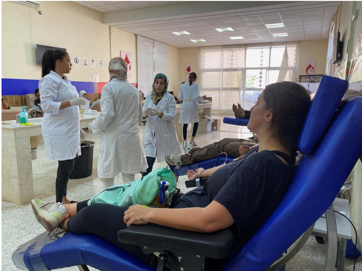
People donate blood after the earthquake in Marrakech.

transfusion center in Marrakech called on the population to donate blood for the numerous injured.