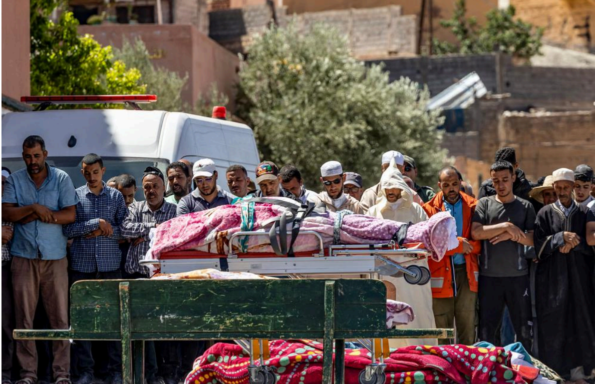
People pray at a body laid out in Moulay Brahim in Al Haouz province.

The emergency services have not yet reached all affected regions of the country. While preparations for operations are in full swing in many countries that have offered help to Morocco, rescuers in the country often search for buried victims with their bare hands.