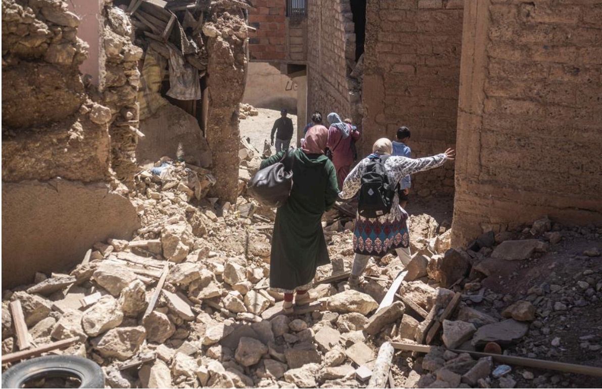
Residents flee their homes in Marrakech.

An AFP correspondent saw hundreds of people sleeping on the ground in the world-famous Jemaa el Fna square in the historic old town because they did not dare return to their homes.