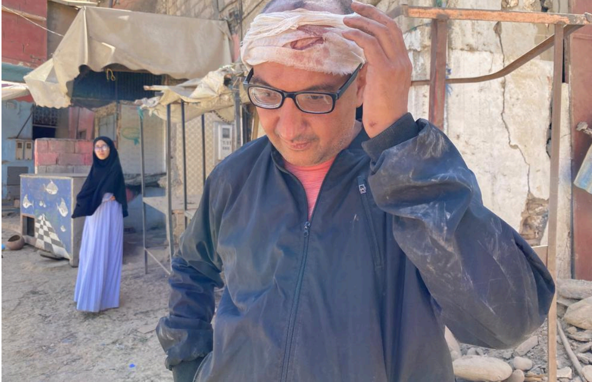
This man in Amizmiz was injured by debris.

In the village of Moulay Brahim, near the epicenter, rescuers dug through the rubble of collapsed houses for survivors. The first graves for the dead have already been dug on a nearby hill, the AFP agency reported.